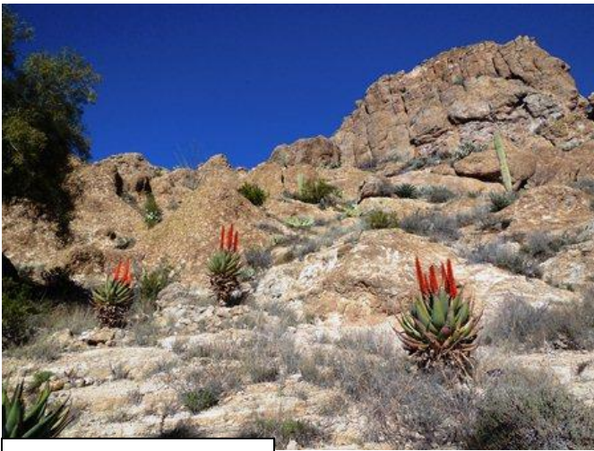
Gold in the desert 2-2015