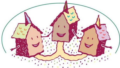
Combined Worship Services

Three area Protestant Churches are going to be sharing worship during the next three months. From June 21 through at least September 20, First Presbyterian in Florence and Community Presbyterian in Coolidge will worship together every Sunday, and on four occasions, St. Michael’s Episcopal in Coolidge will also participate.